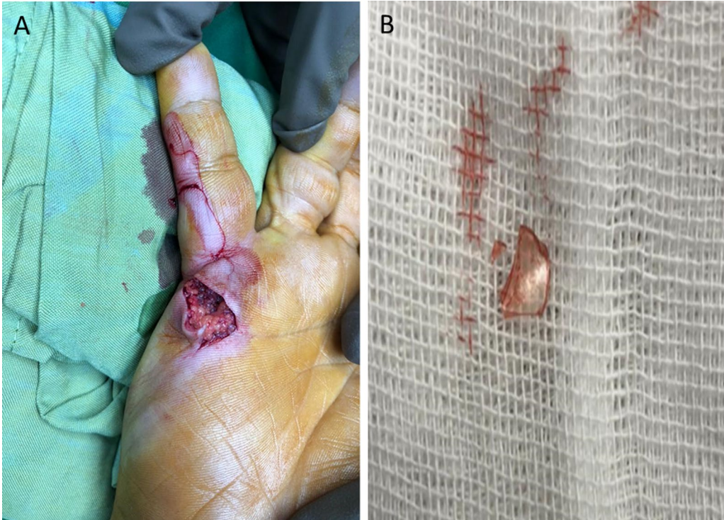
Fig. 2 Discovery of glass foreign body. A Intraoperative exposure revealing an unexpected finding (not shown). B Retrieved encapsulated glass

However, obscurities uncovered on careful historical re-examination frequently illuminate explanatory pathology. In cases of nonspecific extremity discomfort such as this one, exhaustive recounting of past trauma, even minor lacerations healed without intervention, is