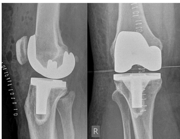
Fig. 1 Postoperative X-ray control following the implantation of right total knee arthroplasty

The day after the surgery, the patient reported severe pain in her right leg, which necessitated an adjustment and an increase in her pain medication. After individual adjustment of her oral pain medication, the standard physiotherapy protocol was continued. On the second day after surgery, the patient experienced massive pain