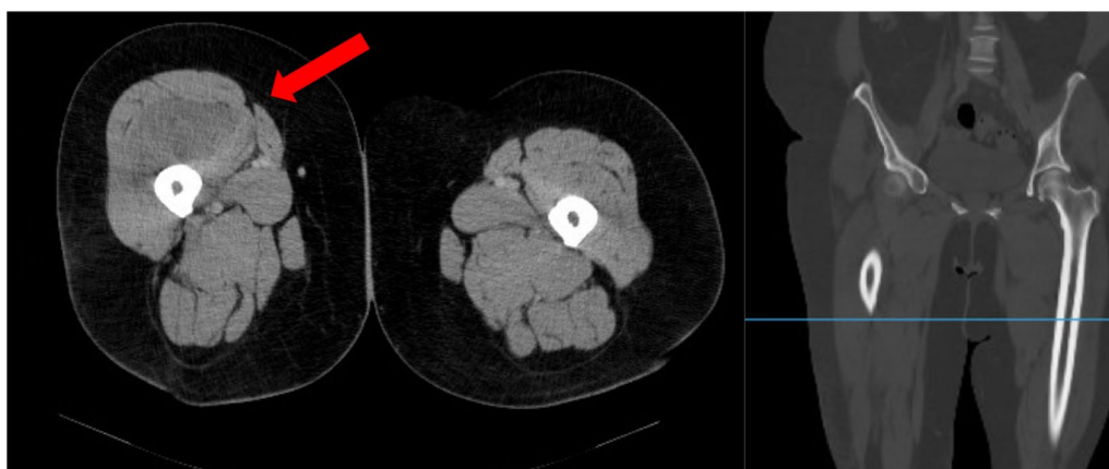
Fig. 2 CT pelvic and leg imaging with contrast medium from postoperative day 2 (red arrow: clear signal alteration and circumferential increase in the vastus intermedius muscle in a side-by-side comparison)

The diagnosis is based on the patient's medical history and clinical examination. Further technical examinations may be necessary for clarification. Risk factors should be evaluated in the medical history. During clinical examination, typical symptoms such as disproportional pain, pain unresponsive to medication, swelling, pain on passive stretch, pallor, paresthesia, and paresis should be observed [4]. Pulselessness can also be considered a differential diagnostic sign for acute arterial occlusion [5]. Whereas our patient experienced pain that was unresponsive to pain medication, circumferential increase and pain on palpation or passive stretch, we wanted to rule out thrombosis as a differential diagnosis. Swelling and pain in the quadriceps muscle after TKA are common postsurgical symptoms. However, the patient's symptoms persisted despite interventions according to our standard protocol, prompting further diagnostic investigation. Due to the patient's obesity, the ultrasound performed was inconclusive, so we held an interdisciplinary round. A CT-scan provides insight into the affected site, revealing complications such as thrombosis, hematoma, or fractures. Due to the rapid availability, we performed a CT scan and discussed the results immediately afterwards. The images clearly indicated the need for surgery, and the patient was prepared accordingly.