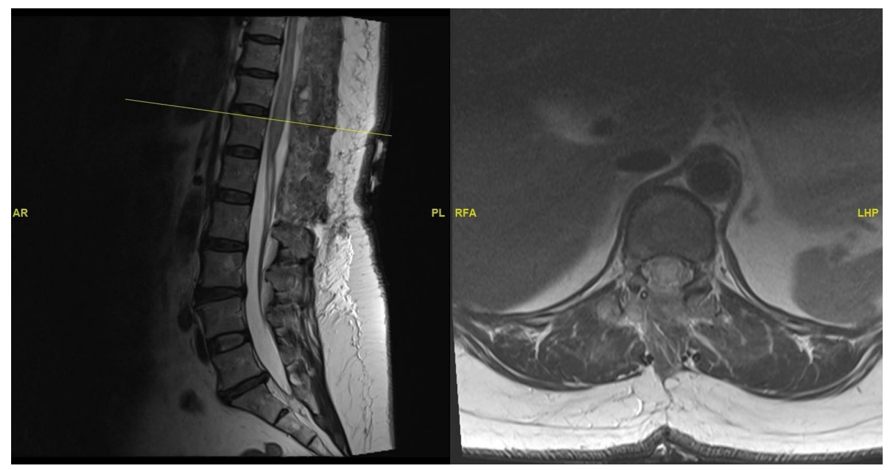
Fig. 2 Post-operative MRI whole spine

Postoperatively, the patient underwent rehabilitation in a step-down facility. Her motor and sensory function remained absent.