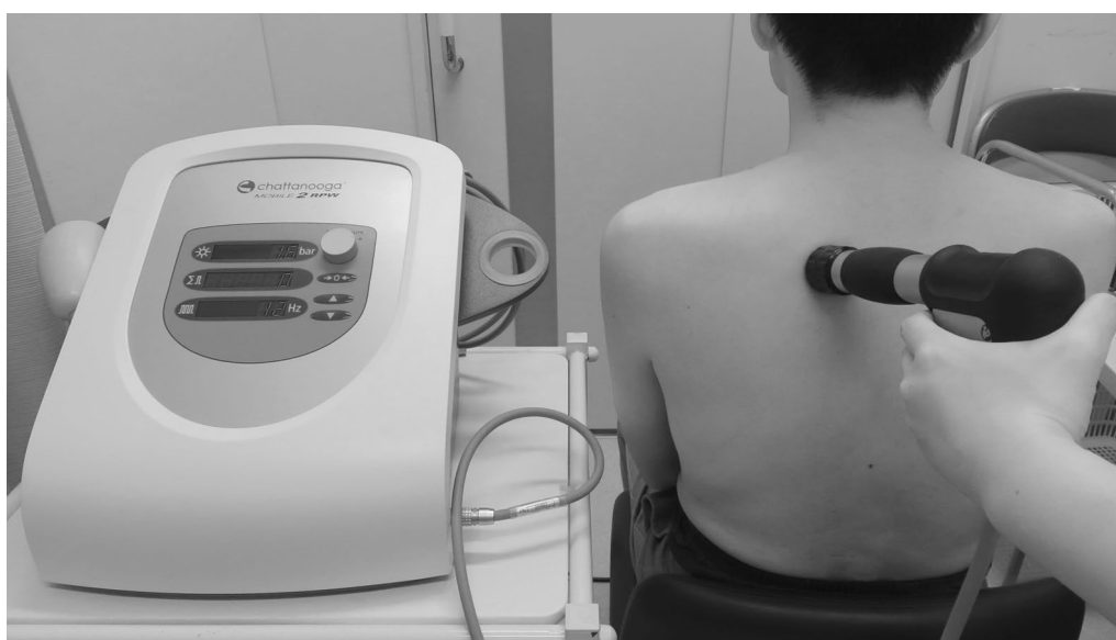
Fig. 1 The extracorporeal shock wave therapy (ESWT) device we used on him and an image of the treatment. This instrument can emit radial pressure wave. This photograph is an image of ESWT; the man is not the patient in this case report

His pain was evaluated using a VAS (rating on a scale of 0 to 10, with high scores reflecting more painful state) [7], the NRS (0 to 10 points; with high points reflecting