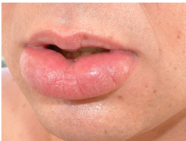
Figure 3 Oral lesion during exacerbation of Crohn's disease (July 2005).

The interesting points regarding the clinical manifestations and the course of our patient were the fact that gran-