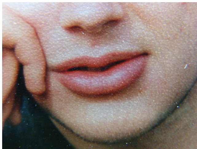
Figure 1 Lip swelling before the appearance of bowel symptoms (June 1996).

The patient was a man aged 25. He was a smoker (20 cigarettes per day) since the age of 19. His symptoms started on June 1998 at the age of 24, with chronic diarrhea not accompanied by mucus or blood in the stools, abdominal pain, fever, or loss of weight. Two years previously on June 1996, he had noticed a slight swelling of the lower lip which contrasted with the previously normal appearance of his mouth (Figure 1). He consulted a specialist in oral medicine, who performed a lip biopsy. The histology of the specimen (13 × 7 × 7 mm) showed a multilayer squamous epithelium covering the tissue specimen, scattered clusters of lymphocytes and histiocytes resembling non-caseating granulomas, as well as infiltration of the small vessel walls of the underlying connective tissue by monocytes (Figure 2). The diagnosis was compatible with granulomatous cheilitis. Colonoscopy performed in 1998 revealed large ulcers in the terminal ileum and caecum. Enteroclysis confirmed the involvement of the terminal ileum in a total length of 50 cm. Administration of meth-