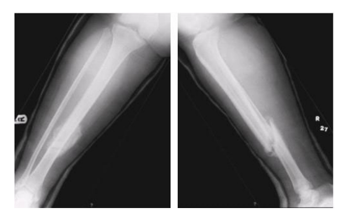
Figure 2 Radiograph following caesarean section, 4 weeks post injury.