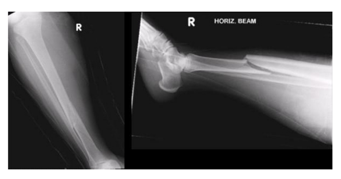
Figure I Initial radiographs.

In this case, we propose that the main contributing factor for accelerated union by four weeks is most likely hormonal. In pregnancy, there is an increase in the level of steroid hormones, initially with progesterone in the first trimester followed by the oestrogens and prolactin in the 2<sup>nd</sup> and 3<sup>rd</sup> trimesters [4]. Oestrogen has well-documented effects on bone formation and remodelling during fracture healing [5]. Radioligand binding studies in a fibula osteotomy (created fracture) model of fracture healing in New Zealand rabbits demonstrated the presence of oestrogen receptors in fracture sites in a bimodal distribution with a peak occurring on day 16 post-osteotomy [6]. Oes-