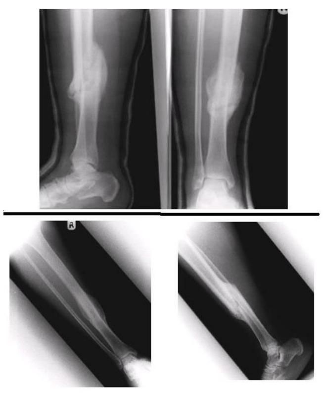
Figure 3 Radiograph 8 weeks and 2 years post injury.

trogen receptors have been shown to be present in fracture callus [7]. It has also been shown that treating ovariectomized rats with oestrogen during fracture healing strengthens the healing callus and increases expression of cartilage matrix proteins [8]. This suggests high levels of oestrogen at this specific time post fracture would have a maximal effect on bone healing as the oestrogen receptors in callus are also maximal at this stage. The hyperdynamic circulation in pregnancy may also contribute to accelerated fracture healing by delivering the cellular factors and hormones to the fracture site at a faster rate. A significant increase in heart rate can be demonstrated as early as the 5th week in pregnancy and this contributes to an increase in cardiac output at this time [9]. There is a progressive augmentation of stroke volume (10-20 ml) during the first half of pregnancy, probably related to incremental changes in plasma volume and as a consequence cardiac output increases from an average of under 5 l/min before pregnancy to approximately 7 l/min at the 20th week of pregnancy [9]. This results in a faster delivery of cellular factors and hormones to the fracture site.