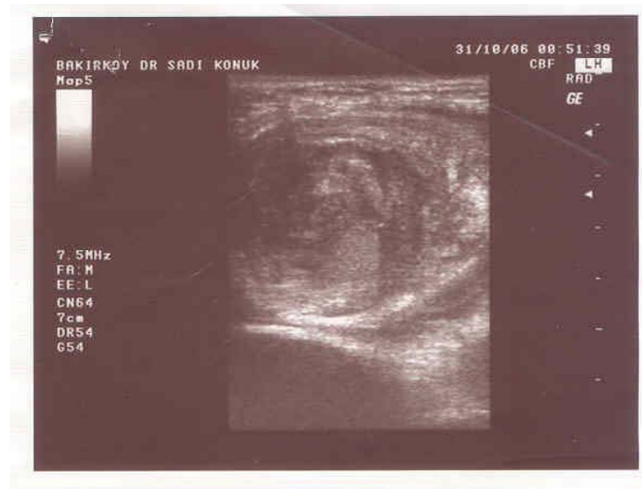
Figure 2 US appearance misdiagnosed as intestinal obstruction "Target sign".