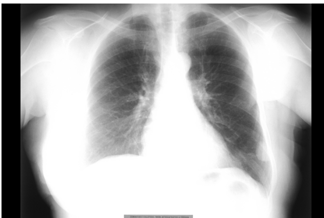
Figure 1 Chest Radiograph.

Finally, a left thoracotomy was performed, revealing a tumor in the outer part of the left lower lobe, which did not infiltrate the visceral pleura. Subsequently, a left lower lobectomy with typical excision of the satellite lymph nodes was completed. Pathological examination revealed a well-circumscribed, whitish, soft tumor measuring 2.5 × 3 × 2 cm. Microscopic examination showed a spindle cell neoplasm, with slit-like spaces and normal adjacent lung