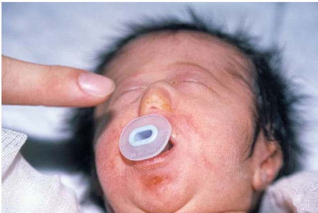
Figure 1 Photograph of the patient.

the nasal nuclei. Nostrils develop from the nasal nuclei. The nasal nuclei migrate posteriorly to form nasal cavities. Meanwhile, the oral and nasal cavities are separated by bucconasal membranes that will rupture at the seventh or