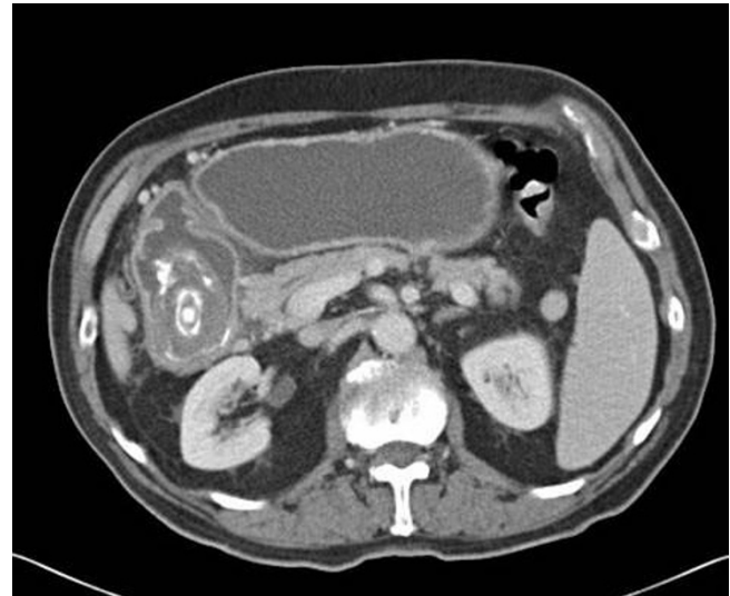
Figure 3 Abdominal CT demonstrating a calcified mass in duodenum.

Post operatively the patient continued to produce large gastric aspirates via a naso-gastric tube. A repeat OGD demonstrated that both afferent and efferent loops were patent. The large gallstone was noted once again but this time in the second part of the duodenum. The patient returned to theatre where this time the gallstone (Figure 4) was successfully milked into the distal jejunum and removed via an enterotomy. The patient made an uneventful recovery.