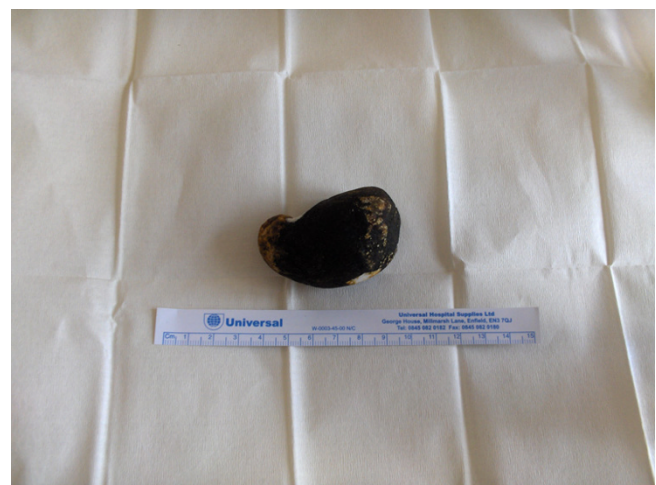
Figure 4 Removed gallstone.