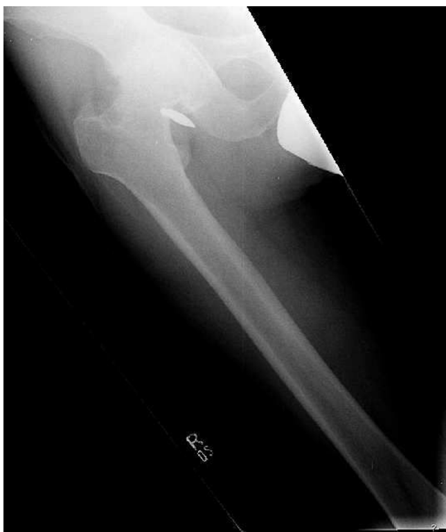
Figure 1 Showing presence of intraarticular bullet in right hip joint and arthritis.

Thirty eight years old male presented with a history of progressive, severe hip pain ten years after a gun shot injury to his right hip. Radiographs at the time of injury confirmed the presence of bullet around the hip joint. He was managed conservatively at that time. Now he was complaining of hip pain for the last two years which had progressively increased significantly over the last six months. Clinically the patient had limited and painful range of motion with 20 degrees of fixed flexion contracture. Current radiographs revealed a bullet fragment inside the hip joint with severe degenerative arthritis (figure 1). Considering the intractable pain and advanced arthritis a right total hip arthroplasty was done. At the time of surgery, about fifty milliliters of fluid was removed from the joint and sent for culture and sensitivity, which turned out to be negative for any microorganism. There was extensive synovitis inside the degenerated acetabulum. The loose bullet fragment was removed easily and an un-cemented total hip arthroplasty (Protek, Mathys Medical) was performed