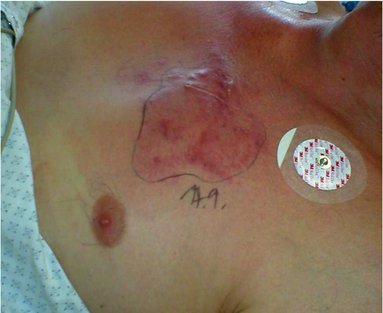
Figure 3 Clinical presentation of progressive furunculosis next to the left sternoclavicular joint.

sensitivity testing of the PVL-positive S. aureus . This may result in major problems with the management of the disease. Contrary to recently proposed therapeutic principles that aim at shortening the duration of antibiotic therapy whenever possible, this condition should be treated aggressively and over a long period of time in order to avoid relapsing infection. The "PVL-syndrome" might create a growing threat in the years to come – physicians treating staphylococcal infection should be watchful and alert.