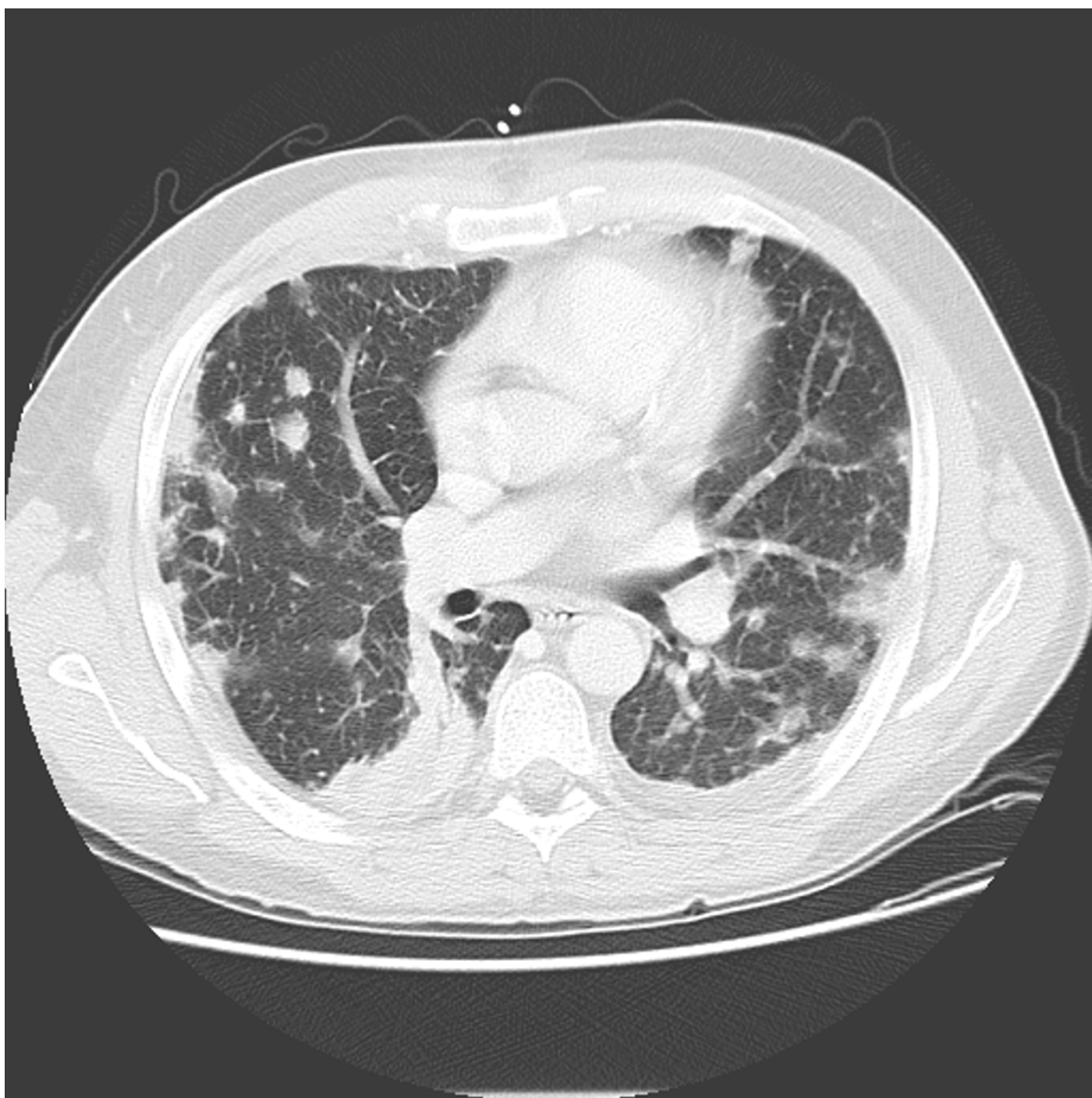
Figure 1 High-resolution (HR-)CT-scan at admission showing signs of severe pulmonary infiltration.

apy with linezolid, imipenem and clindamycin. Interestingly, although this may certainly have been a coincidence, the clinical break-through seemed to be related to a change in the anti-microbial regime. The change to daptomycin and clindamycin was instituted as at this point in time therapy-refractory progressive metastatic soft tissue infection occurred despite organism-sensitive triple antibiotic therapy. Although daptomycin may be considered in cases of severe metastatic soft tissue infections, it seems important to mention that it should not primarily be used for the treatment of pneumonia. This is due to the fact that daptomycin is inactivated by pul-