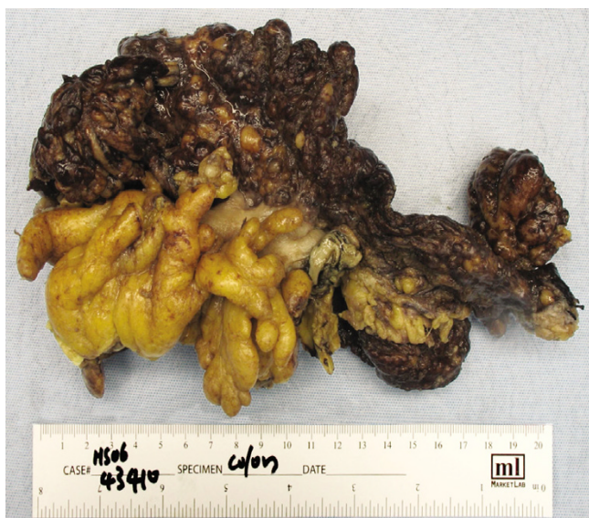
Figure 2 Gross picture of a segment of transverse colon with attached omentum. The Omentum is firm, nodular, and totally replaced by tumor.

The patient presented with a diagnosis of metastatic adenocarcinoma of the colon. Her personal history of colonic polyps and her strong family history of colon cancer supported this diagnosis. Endoscopic and pathologic findings were inconsistent with advanced colorectal cancer. Radiologic imaging demonstrated peritoneal carcinomatosis but could not identify a unique origin. Accurately identifying the origin of the patient's peritoneal carcinomatosis